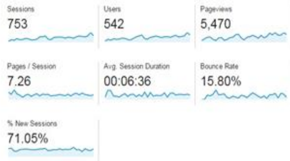
Fig-3a No. of sessions in the website in month of November 2014

In the above google analytics image, it has been observed that by using the selective approach numbers of users are increasing day by day in the month of November 2014.