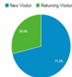
Fig-3b Users % on the website in month of November 2014

The above graphs were plotted from google analytics of the website www.rtupaper.com in the month of November 2014. Which shows that there were only 753 sessions and 542 users with page views of 5470 and the % of new sessions were 71. Percentage of returning visitors were 29%.