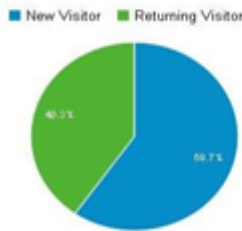
Fig-4b Users % on the website in month of February 2015

The above graphs were plotted from google analytics of the website www.rutupaper.com in the month of February 2015. Which shows that there are 1554 sessions and 1110 users with page views of 9337 and the % of new sessions were 60. Percentage of returning visitors were 40%.