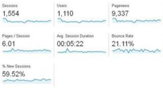
Fig-4a No. of sessions in the website in month of February 2015

units. There is an immense opportunity for the designers to come up with a new mobile app for the same.